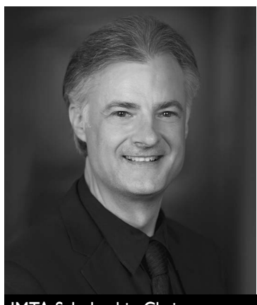
IMTA Scholarship Chair

Conference is a wonderful time to learn, connect, and network with others! Please consider attending and, better yet, participating!